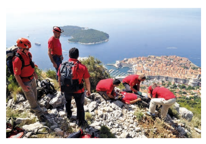
Joint exercise of the MRS's members on the mountain Srd above Dubrovnik

"I would say that the project has helped me and my colleagues from the group in converting a former hobby into a business. Travel agency 'Kayak Montenegro' engaged me to conduct tours on Lake Skadar. After that, I received a call from travel agency "Undiscovered Scotland" and we have been successfully cooperating for three seasons now. In addition, I made good contacts with several agencies from Croatia and Albania and organised a few tours on Lake Skadar and the Bay of Kotor."