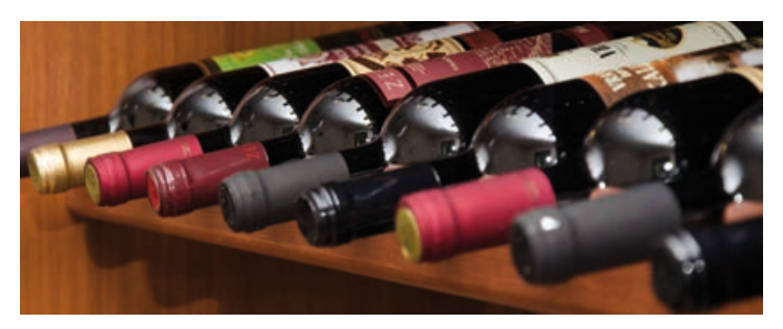
A detail from the Wine House in Cetinje