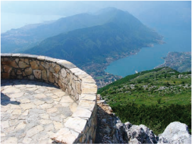
Sightseeing point in national park Lovćen in the location with a characteristic view to Boka bay set up within the project

The project has provided touristic valorisation of protected natural areas in Montenegro and Dubrovnik-Neretva County in Croatia. Project activities have resulted in the increase of the number of tourist visitors in the protected natural areas. Furthermore, collaboration among institutions operating in the management and protection of natural areas has been established, bringing new project ideas.