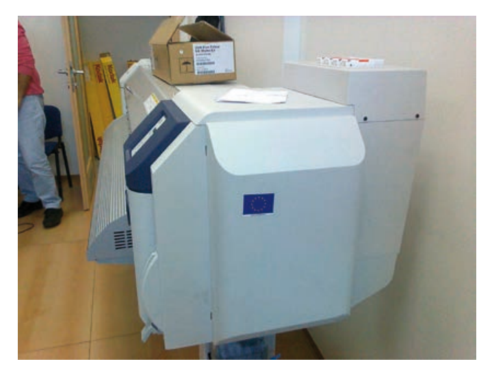
Plotter for large format printing procured within the project