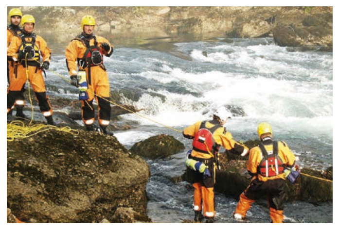
Joint Swift Water Rescue training held on Zeta River in Montenegro