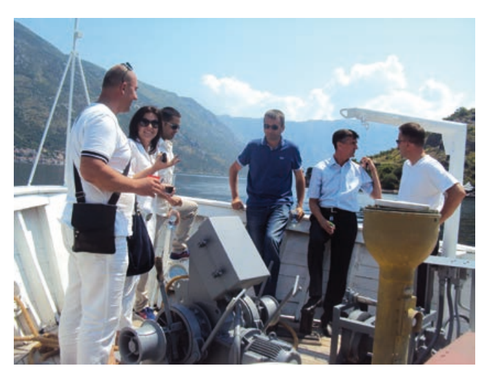
Detail from promotion of hydrographic equipment procured within the project.