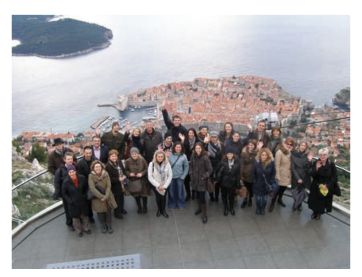
Workshop on GIS application on landscape analysis in Dubrovnik