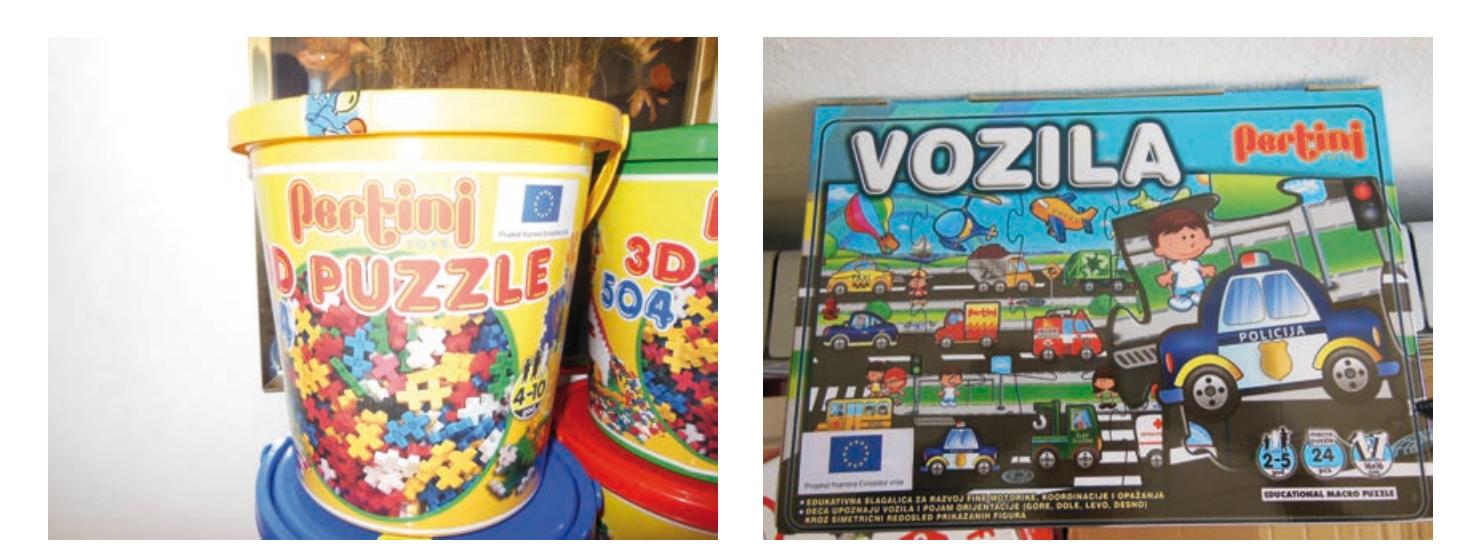
Toys procured for kindergartens within the project, covering various social, logical, mathematical, socio-emotional and motoric games

"At the seminars we acquired knowledge on the areas of the brain that control speech and thinking and the importance of developing motor skills during early childhood. Except for the theoretical part, a positive aspect of the training was the possibility to transfer educational theory into practice. In my everyday work, I try to implement an interesting new game that is age appropriate and in accordance with the settings of the Mensa NTC learning system."