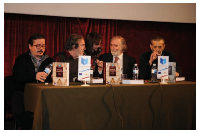
Promotion of the publication "Poslije Hamleta" ("After Hamlet")