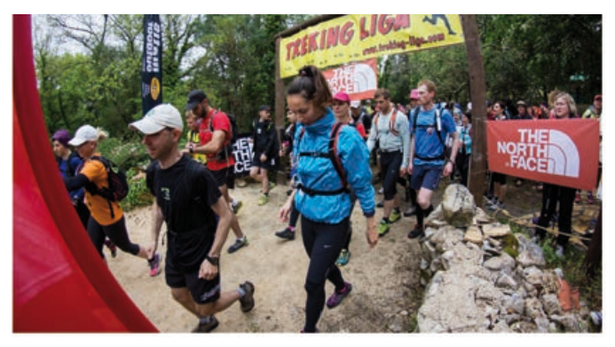
The race held as part of the project promotional event in Konavle

"Through practical examples and lectures of world-renowned experts in tourism, the project enabled me to gain new information and knowledge that I consider extremely useful for future business development. During monitoring and participating in the project, I acquired knowledge that is very interesting and applicable in practice."