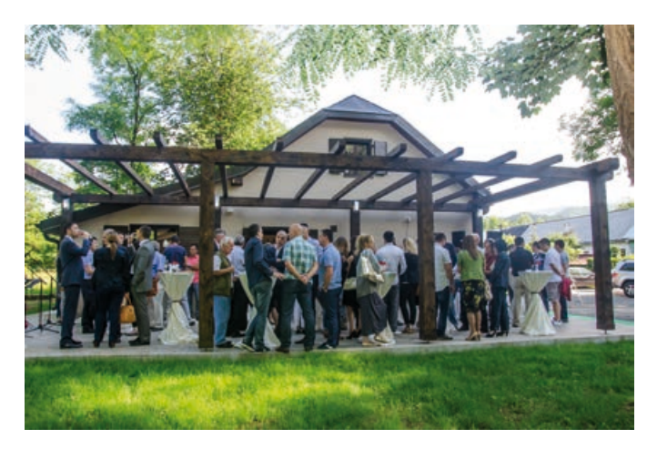
Reconstructed Wine house in Cetinje

Implemented activities have contributed to raising awareness of the importance of wine as an authentic product of the crossborder area as well as its role in tourism offer. The number of visits conducted to Wine House in Cetinje is a significant sign of its further sustainability. Additionally, the fact that Dubrovnik-Neretva County carried on with organisation of Dubrovnik "FestiWine" after the project completion is a proof that the results of the project are sustainable, as "FestiWine" has become an important event in the touristic preseason.