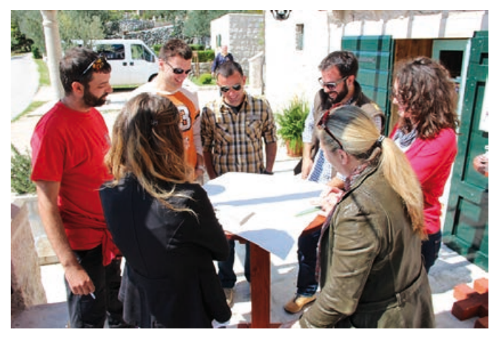
One of the working groups at specialised "Hiking and trekking" training