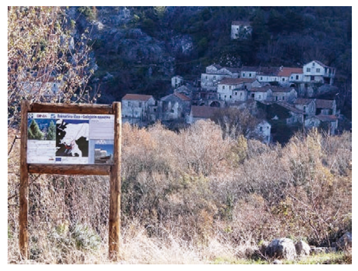
Biodiversity trail on Lake Skadar