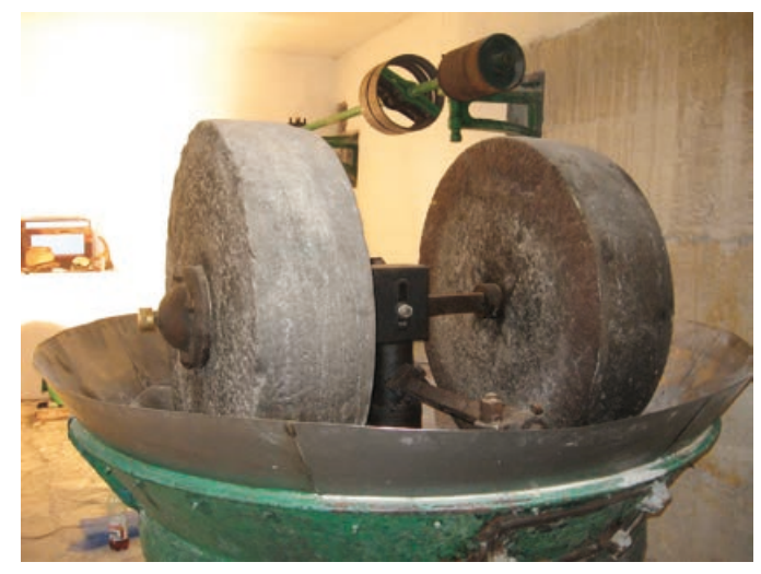
The old stone mill in Pelinovo, Montenegro