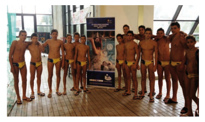
Young water polo players of Jadran before the match in swim suits procured within the project

Training during Youth Water Polo Cross-Border Campus