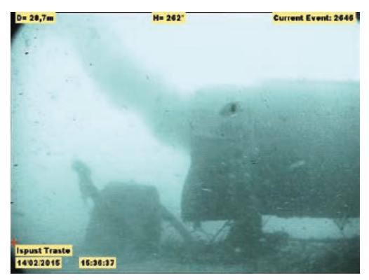
Outfall in bay Trašte in Montenegro