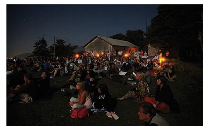
Concert "Music on the night of the full moon" held near the fort on Vrmac within the campaign Landscape days

A new methodology of landscape valorisation in the context of the European Landscape Convention, "Operational Guidelines for Cultural World Heritage properties and Guidance on Heritage Impact Assessment for Cultural World Heritage properties", was established through the project studies. The proposed methodologies include guidance on city planning in line with the sustainable development concept based on authenticity of the space and human activities. The studies made within the project are planned to be used as a basis for the Spatial Plan for the County, Spatial Plan for the City and General Urban Plan in Croatia and Montenegro and should provide guidelines for sustainable planning with protection measures and recommendations for legal protection.