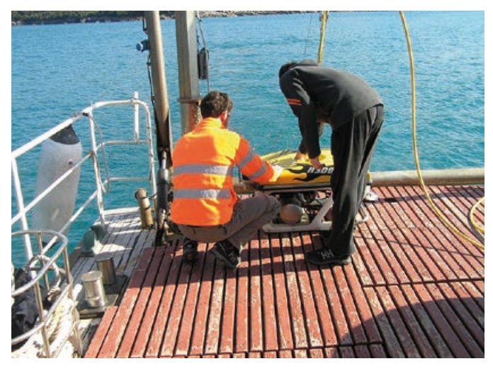
Valuable equipment procured within the project - the Niskin samplers with messengers, CTD probe, the total organic carbon (TOC) analyser, TOC module in sediment, turbid meter, total station for hydrographic research, multiparameter depth probe for oceanographic measurements, UV-VIS spectrophotometer and a Remotely operated underwater vehicle worth EUR 101,250.00

"Our involvement during the implementation of the project helped the achievement of a joint cross-border approach in the prevention of marine pollution from the aspect of safety of navigation and marking of submarine outfalls of wastewater. The costs of investment in the facilities of maritime signalisation and maintenance for marking submarine outlets are incomparably lower than the costs incurred due to damage of the outfalls that contaminate the sea."