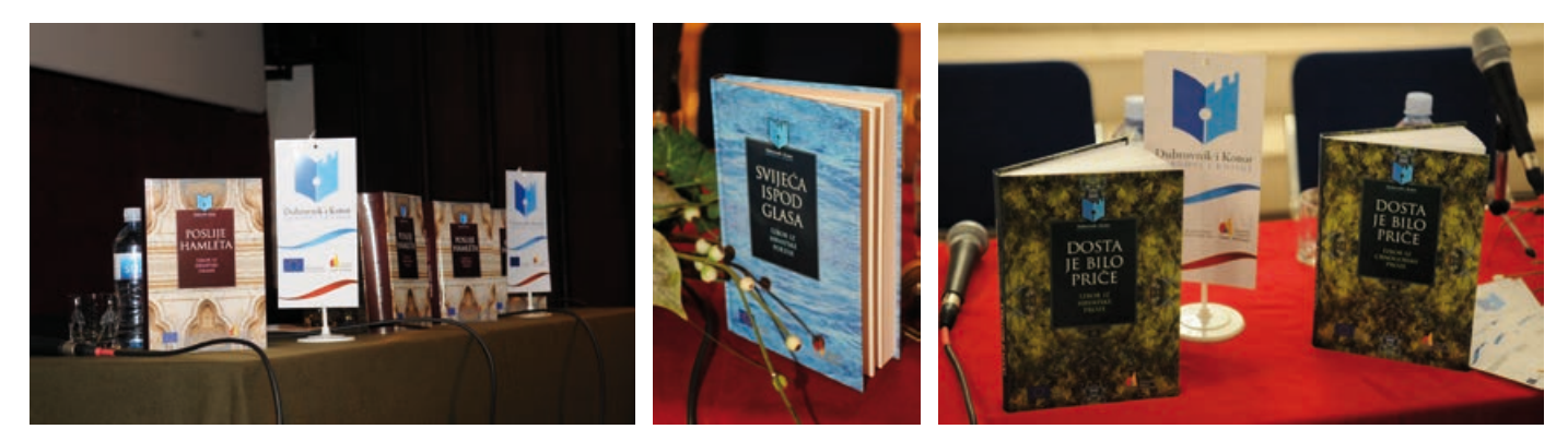
The three publications published within the project; "Poslije Hamleta" ("After Hamlet"), "Svijeća ispod glasa" ("Candle under the voice") and "Dosta je bilo priče" ("Enough with the story")

The project noticeably contributed to the development of cultural cooperation, as proven during the promotions of publications in Kotor, Cetinje and Dubrovnik, where the reading public showed great interest in the literary works of the two related cultures.