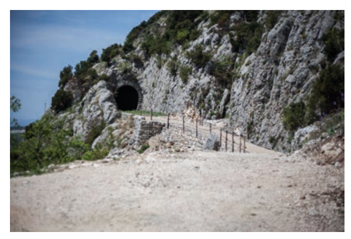
The narrow-gauge railway adapted as a hiking and cycling route in Konavle

Furthermore, all project participants had the opportunity to get acquainted with current trends, gain knowledge on the tourists' requirements and learn about new marketing tools.