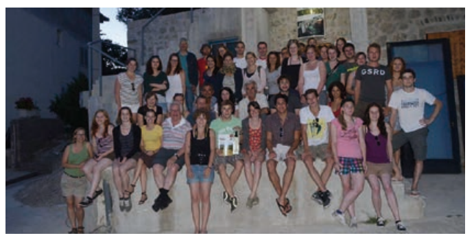
Students from Austria during visit to stone mill in Pelinovo, Montenegro