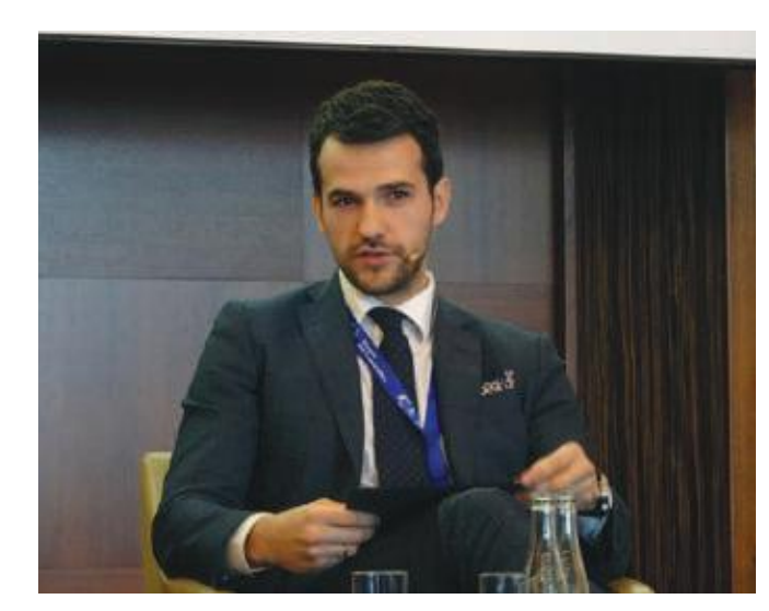
Author: Marko Mrdak, Deputy Chief Negotiator for the EU Acquis Chapters

ontenegro's position as afrontrunner in the EU integration process is not only reflected in the number of open and closed negotiation chapters, but also in continuous strengthening of institutions that strive to ensure the living standards comparable to the EU Member States in their respective policy areas. In this regard, we have just emerged from a very intensive period essentially focused on building the system that guarantees the rule of law, and fosters overall economic development.